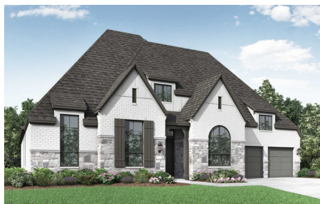
4508 Meander Way Available November 2024 4 Bed | 4.5 Bath | 1 Story $1,161,757 | 3,700 Sq. Ft.