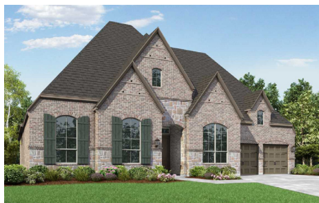
4440 Meander Way Available November 2024 4 Bed | 4.5 Bath | 1 Story $1,176,832 | 3,700 Sq. Ft.