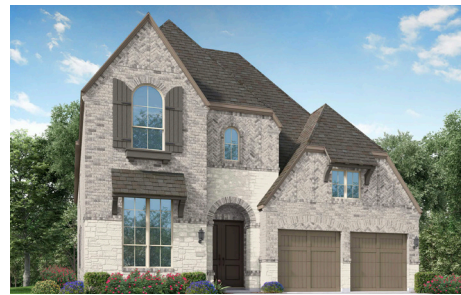
3913 Linear Drive Available November 2024 4 Bed | 4.5 Bath | 2 Story $961,437 | 3,509 Sq. Ft.