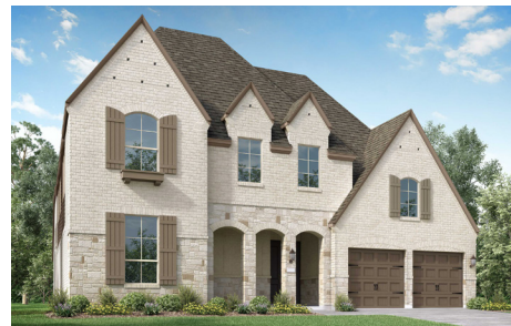
4808 Cordwood Drive Available November 2024 4 Bed | 4.5 Bath | 2 Story $1,000,000 | 4,111 Sq. Ft.