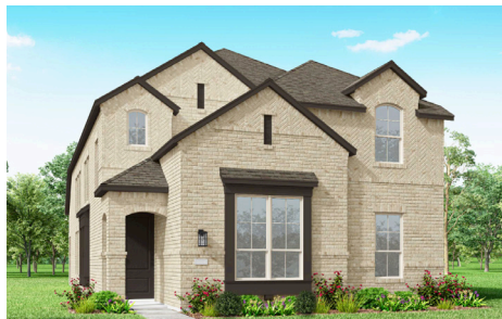
3917 Wild Tulip Drive Available November 2024 4 Bed | 3 Bath | 2 Story $729,606 | 2,579 Sq. Ft.