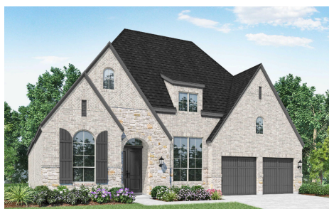
4014 Trellis Drive Available October 2024 4 Bed | 4.5 Bath | 1 Story $954,780 | 3,050 Sq. Ft.