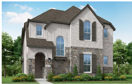
3913 Wild Tulip Drive Available November 2024 4 Bed | 3 Bath | 2 Story $650,000 | 2,273 Sq. Ft.