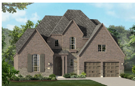
4217 Linear Drive Available November 2024 5 Bed | 4.5 Bath | 2 Story $1,045,321 | 3,961 Sq. Ft.